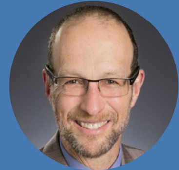
Commissioner Clifford Rechtschaffen