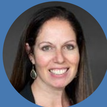
Commissioner Darcie L. Houck