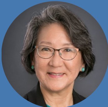
Commissioner Genevieve Shiroma